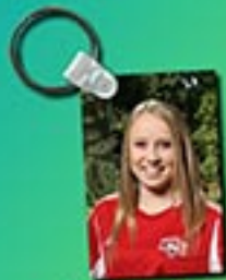
Double-sided Key Chain