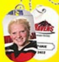
Double-sided Dog Tag