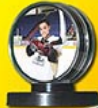
Puck & Stand