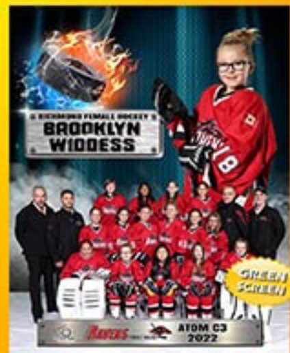
"All-in-One" Memory Mate