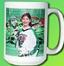
15 oz. Mug